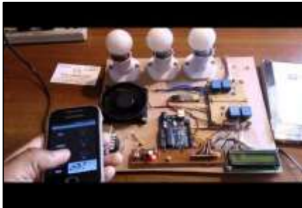
Figure 2. Hardware system

The suggested Home Automation and Security system is composed of three main modules: nodemcu esp8266 as Web Server, Hardware Interface module and Human Interface which can be accessed from any PC or Wi-Fi enabled phone. In case of long distance communication without using wires, Wi-Fi router provides convenient and cost-effective way of communicating with our sensors and actuators from webpage. Data being gathered from sensors, such as PIR sensors, temperature sensors, IR transmitter and receiver is being processed on server and then disseminate with an attached Ethernet Shield using the TCP/IP protocol via Wi-Fi router.