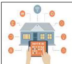
Figure 1. Smart house

This paper focuses on the security of a home, energy production of the home , and energy efficiency of the home. Some security system in the house include fingerprint scanner, CCTV surveillance. Some energy sources are solar power, piezo electric generation. The main objective of home automation and security is to help handicapped and aged people that will enable them to control home appliances and alert them in critical situations.