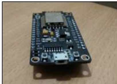
Figure 3. Nodemcu esp8266

This module is the heart of the proposed home automation and security system. It is made up of sensors and actuators.